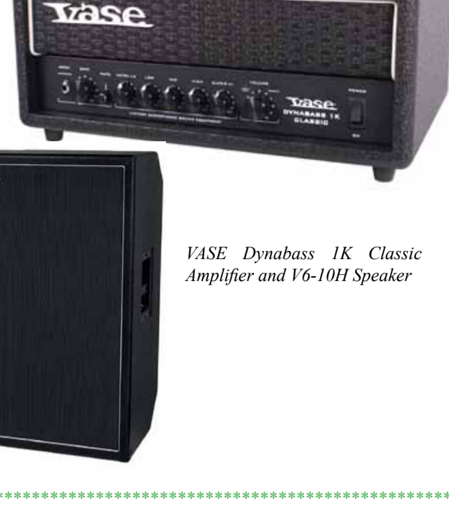
VASE Dynabass 1K Classic Amplifier and V6-10H Speaker

THE BOTTOM LINE "The Dynabass 1K Classic represents a great marriage of old-school charm and new-school reliability, and is a very welcome return for an Australian amp icon. This is a very roadworthy amp capable of taking whatever you can throw at it." Australian Guitar