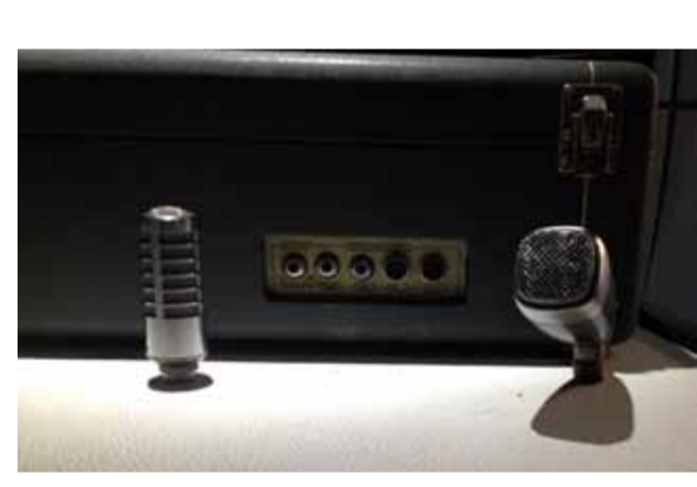
Small photos clockwise from center above travel case, older VASE logo, case back with microphone jacks and two mikes and additional jacks, left.