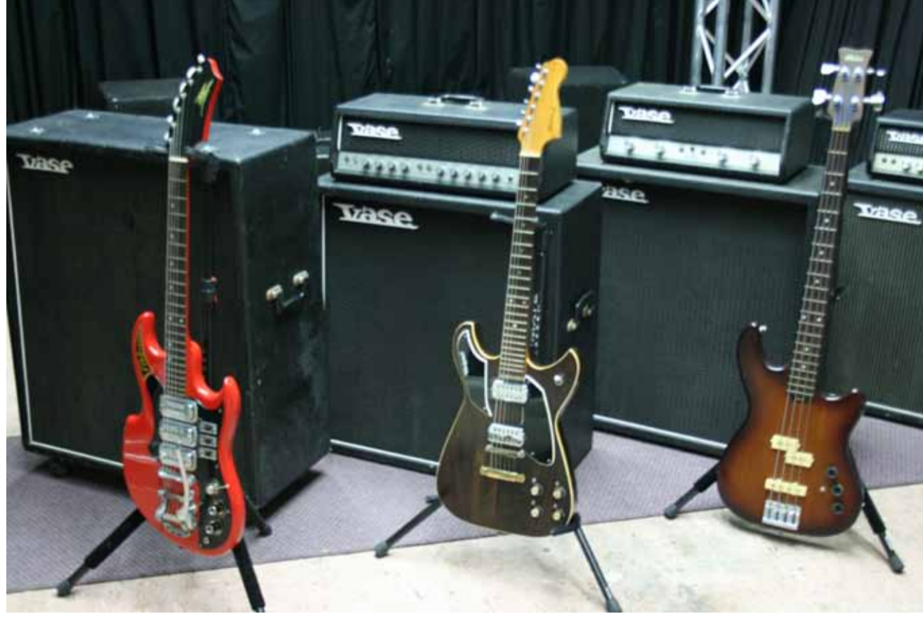
Maton Fyrebird in front of 4 x 12 Bass Cabinet, Wedgtail in front of VASE Trendsetter 60 Deluxe on 3 x 12 open back cabinet, and Maton Jumbuck Bass between Vase 80 watt Dynabass on 3 x 12 closed back cabinet and Vase Trendsetter 40 with Reverb on a 4 x 12 closed back cabinet

Greg's VASE collection (to date) and a few of his Matons pictured below.