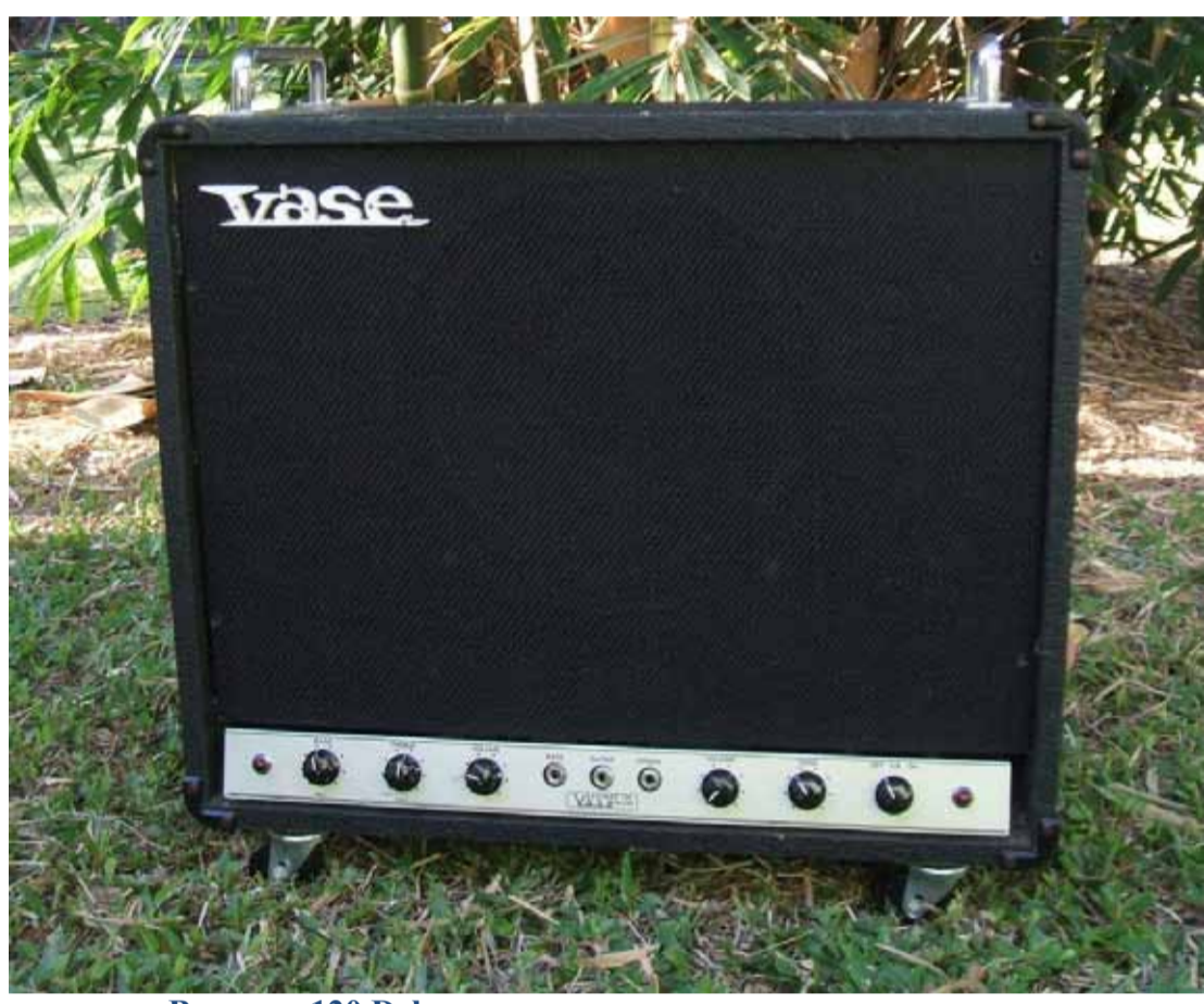
Bassman 120 Deluxe