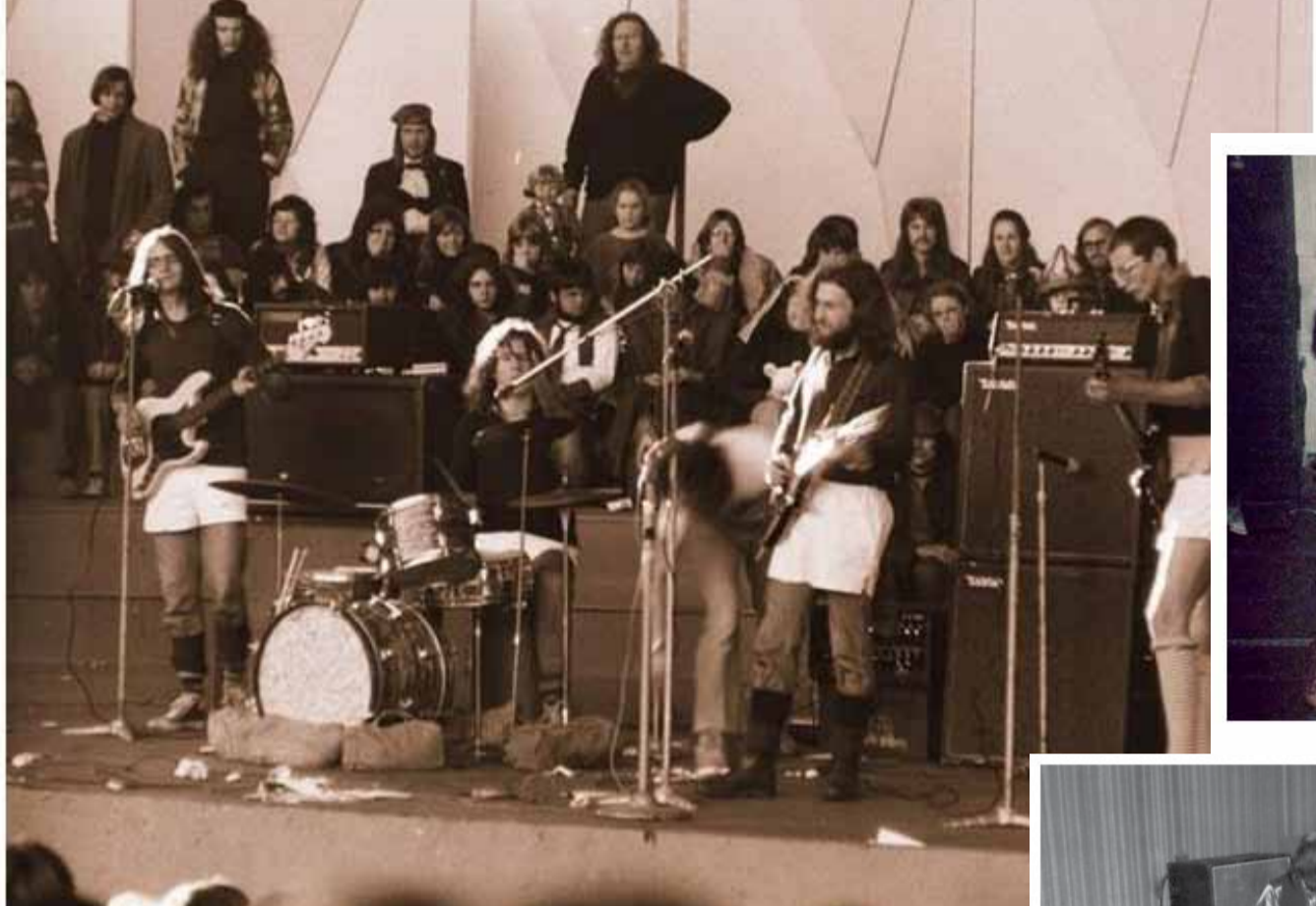
DADDY COOL AT THE MYER MUSIC BOWL