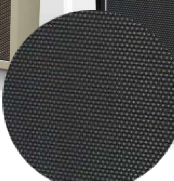
Vintage Grille Cloth