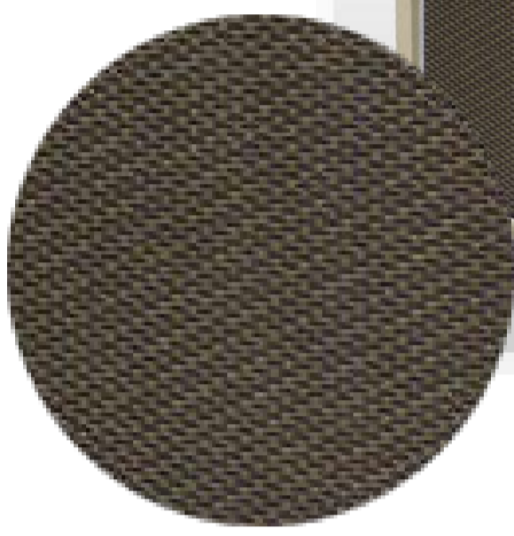
Heritage Grille Cloth