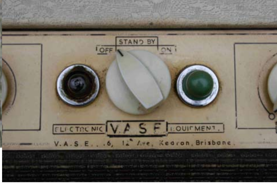
Kedron address on front plate