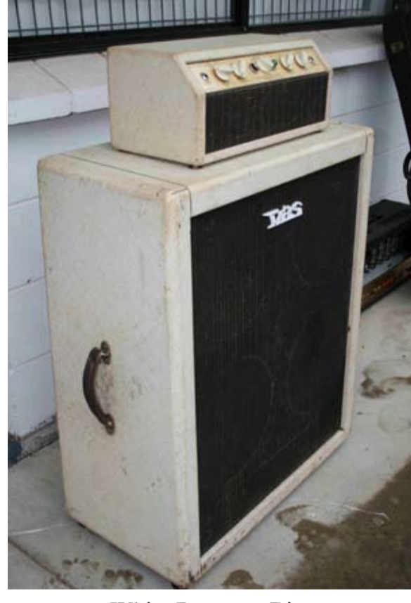
White Bassman Rig