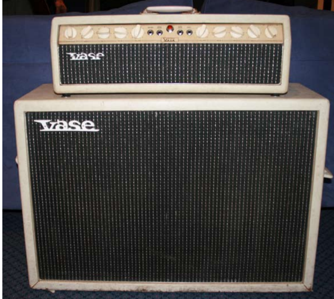
Fender Bandmaster inspired??

Unfortunately we can't remember why it came to visit or who its owner is, so if he sees this maybe he could refresh our memories!