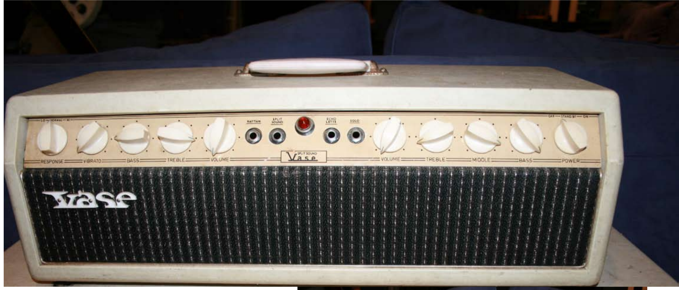
Chassis design differs from most

Sometimes old VASE amps are brought in to us by their owners for various reasons. This was a remarkable one, a Splitsound with unusual inputs, labelled guitar , split sound , echolette and solo . Also the grill cloth and the shape of the speaker cabinet are reminiscent of a Fender Bandmaster, which is of the same era. We snapped some shots while it was here.